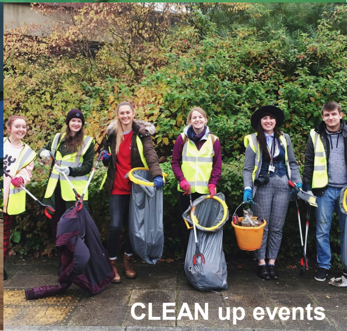
CLEAN up events