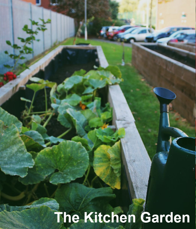
The Kitchen Garden