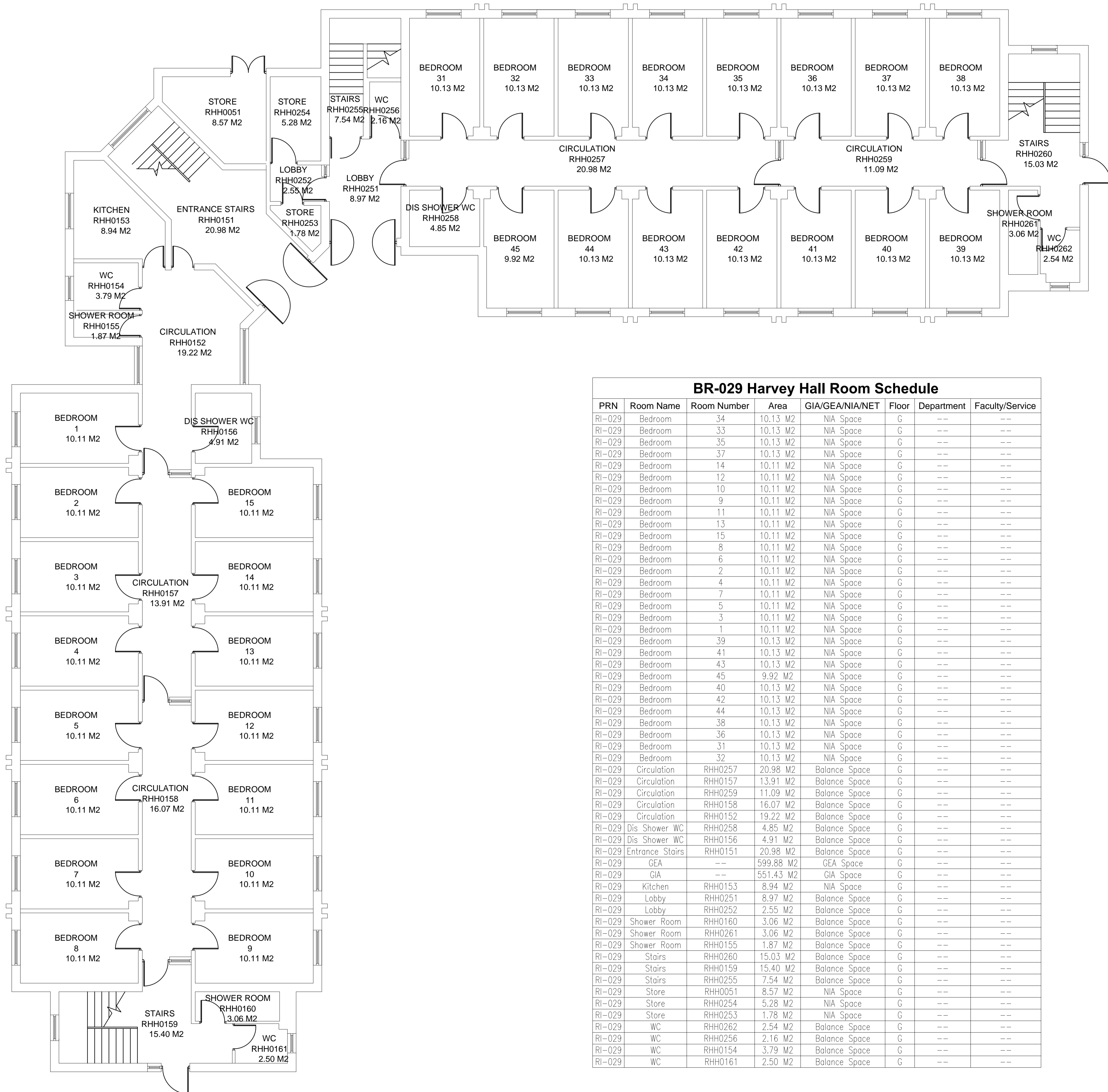
BR-029 Harvey Hall Room Schedule

NOTES CONTRACTOR TO CHECK ALL DIMENSIONS ON SITE DO NOT SCALE